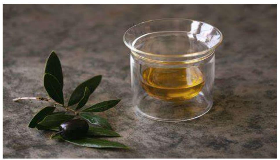
Fig no-3 Olive leaf extraction

The filtered extract is then Evaporate at room temperature on a rotary evaporator. Vacuum. Production of cream using olive leaf extract A base cream was prepared containing an aqueous phase and an oil phase. Of Composition and amount of formulation ingredients . For the preparation of all creams The ingredients are assembled according to the formula of Add various olive leaf extracts to Concentration (0.1%, 0.4%, 1.0% w/w).